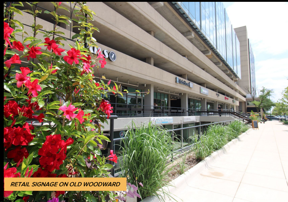
RETAIL SIGNAGE ON OLD WOODWARD