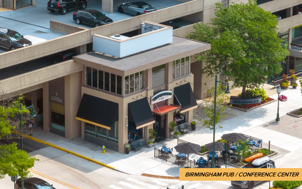
BIRMINGHAM PUB / CONFERENCE CENTER