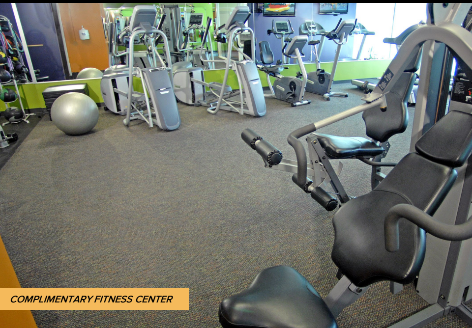
COMPLIMENTARY FITNESS CENTER